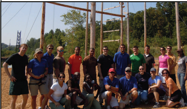
Fellows participate in ropes course activities.