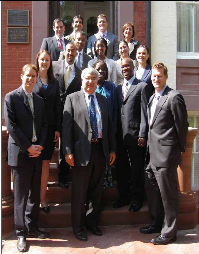
Fellows meet with Chief of Staff, Peter Rouse.