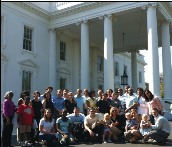
White House Fellows and their families tour the White House..

I'm used to seeing guys with guns hanging out in the hallway, but I'm still trying to figure out where all the ladies hide their chewing tobacco. Cultural differences aside, the pace and energy of the office are nothing short of inspiring, and I have already learned a tremendous amount about the art of policy-making. Luckily we have a First Lady who is deeply committed to military families, so I have been able to immediately engage on a set of issues central to my career while also getting a feel for the nuances of national-level politics. Over the next year, I expect military-family outreach to be my primary focus, but I will also be working on issues related to community service and education. It promises to be a great year.